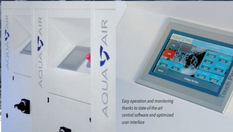
Easy operation and monitoring thanks to state-of-the-art control software and optimized user interface